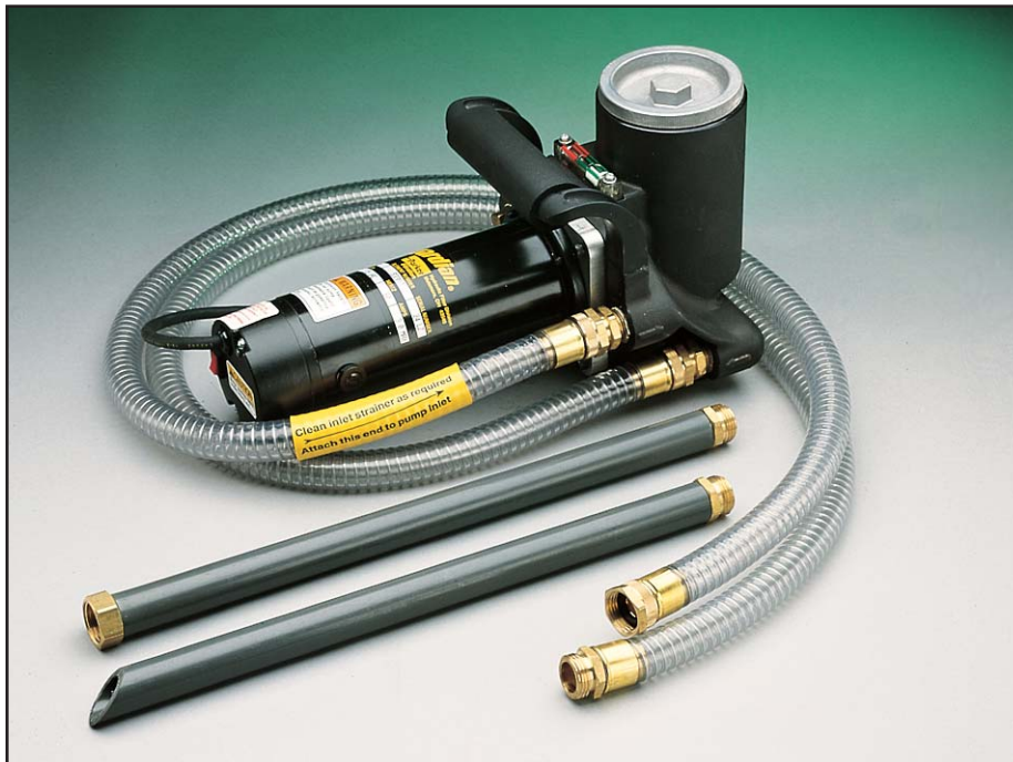
Guardian® Portable Filtration System